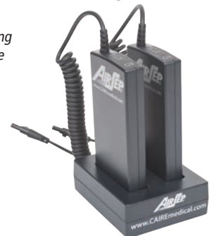
External Power Cartridge and Charger Combo (BT026-1); includes battery (1), charger (1), and power supply (1)

Call 1.800.482.2473 to order! www.CAIREmedical.com • www.AirSep.com