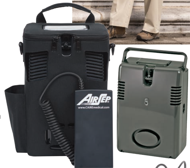
FreeStyle 5 shown with new carrying case and External Battery Cartridge